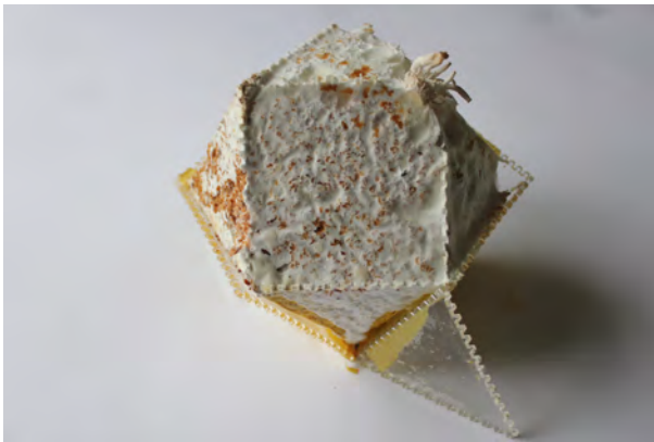
Figure 2: Mycelium Form, 2011

Sign in for the workshop at: mail@makeandthink.de