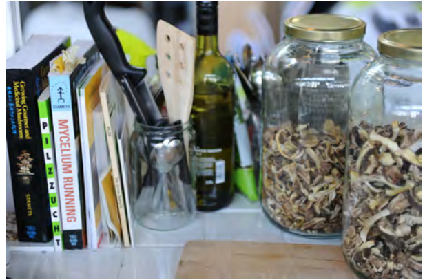
Figure 4: Workshop 2012