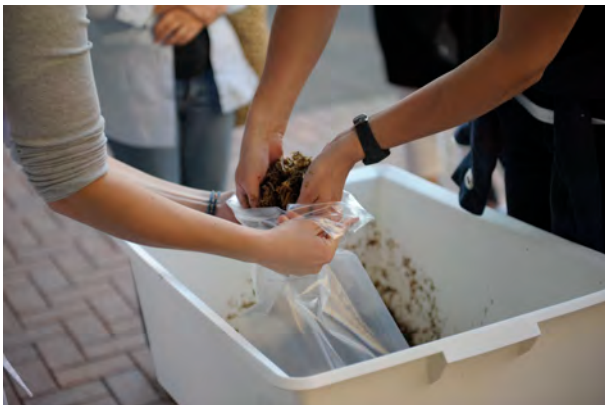
Figure 3: Workshop 2012